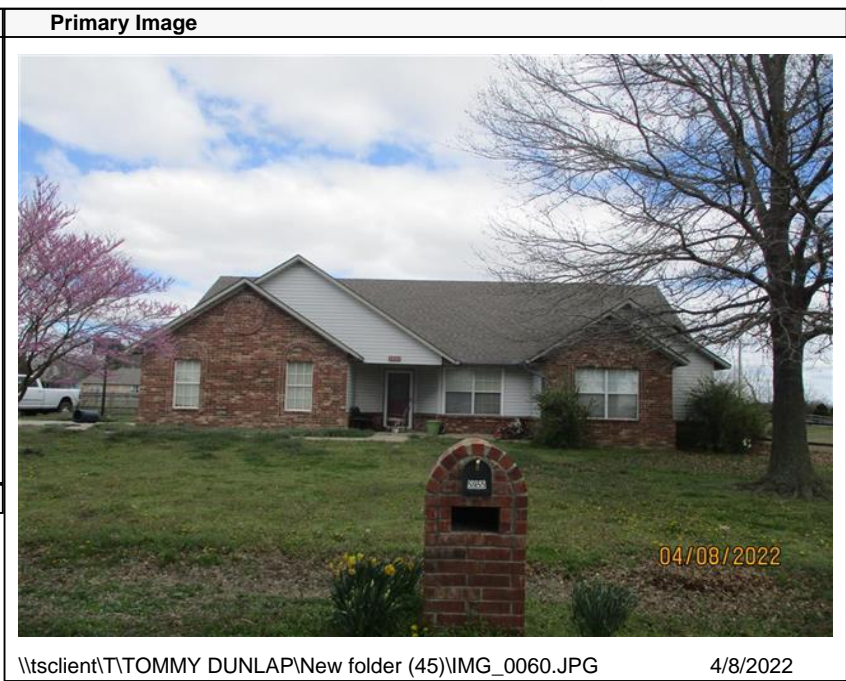
\\tsclient\T\TOMMY DUNLAP\New folder (45)\IMG_0060.JPG 4/8/2022