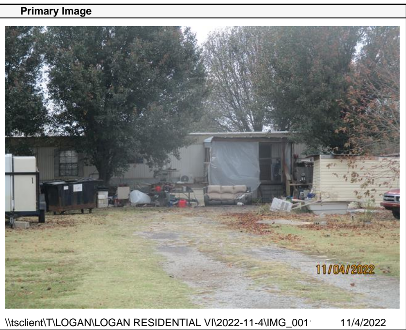
\\tsclient\T\LOGAN\LOGAN RESIDENTIAL VI\2022-11-4\IMG_001 11/4/2022