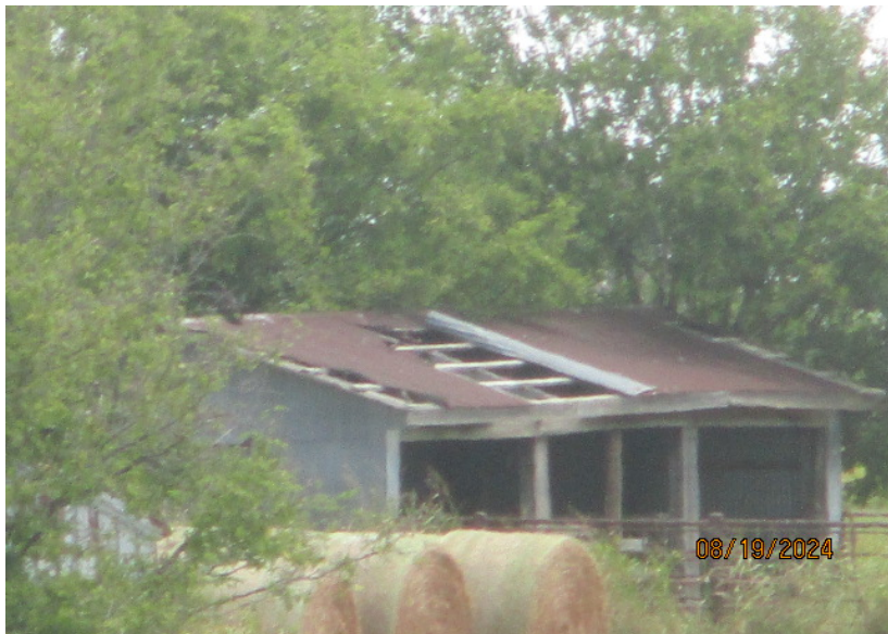
\\tsclient\T\TOMMY DUNLAP\New folder (373)\IMG_0005.JPG 8/19/2024

Lot Size Lot Count Units Buildable Non-Ag Acres 0 Topography Street Access Utilities Amenities LAND QUALITY Method Units-Buildable Base Lot Value Factor Value Adjustments Lot Value