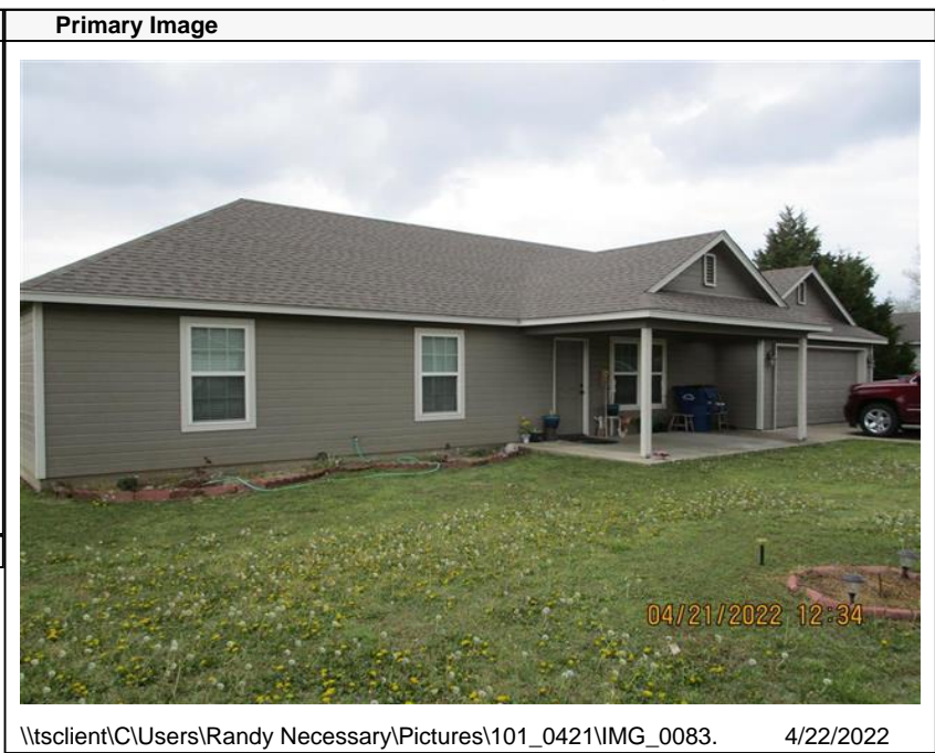
\\tsclient\C\Users\Randy Necessary\Pictures\101_0421\IMG_0083. 4/22/2022