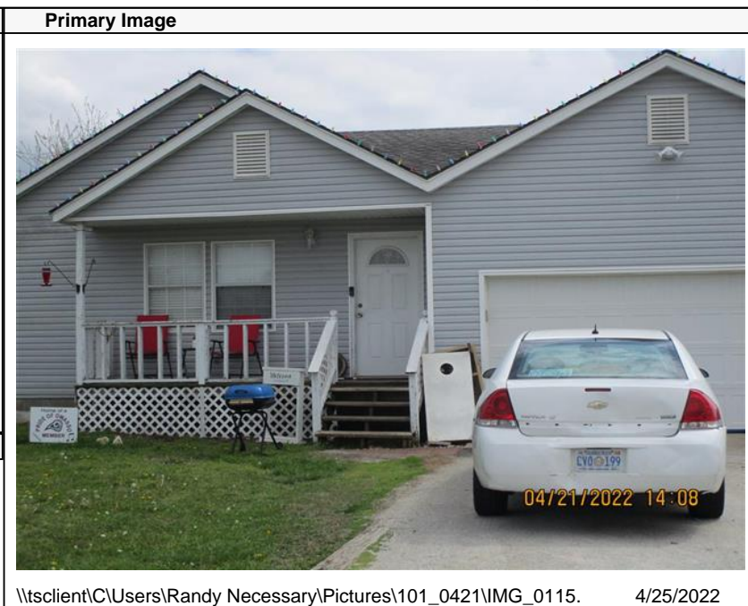
\\tsclient\C\Users\Randy Necessary\Pictures\101_0421\IMG_0115. 4/25/2022