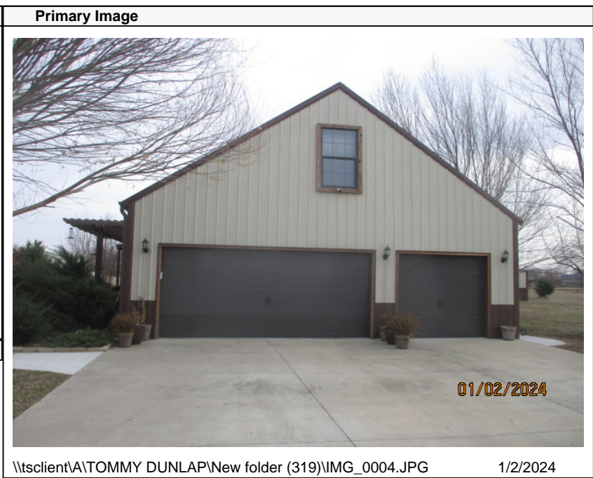
\\tsclient\A\TOMMY DUNLAP\New folder (319)\IMG_0004.JPG 1/2/2024