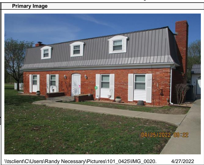
\\tsclient\C\Users\Randy Necessary\Pictures\101_0425\IMG_0020. 4/27/2022