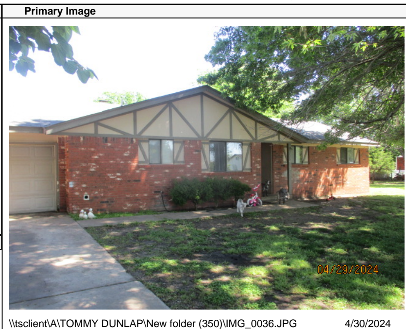
\\tsclient\A\TOMMY DUNLAP\New folder (350)\IMG_0036.JPG 4/30/2024