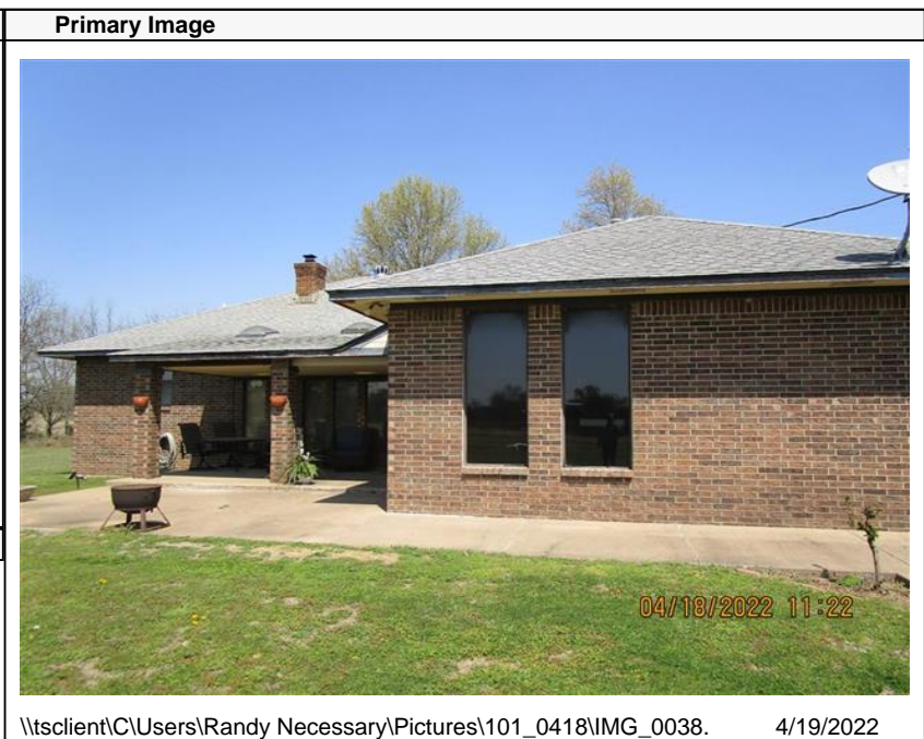
\\tsclient\C\Users\Randy Necessary\Pictures\101_0418\IMG_0038. 4/19/2022