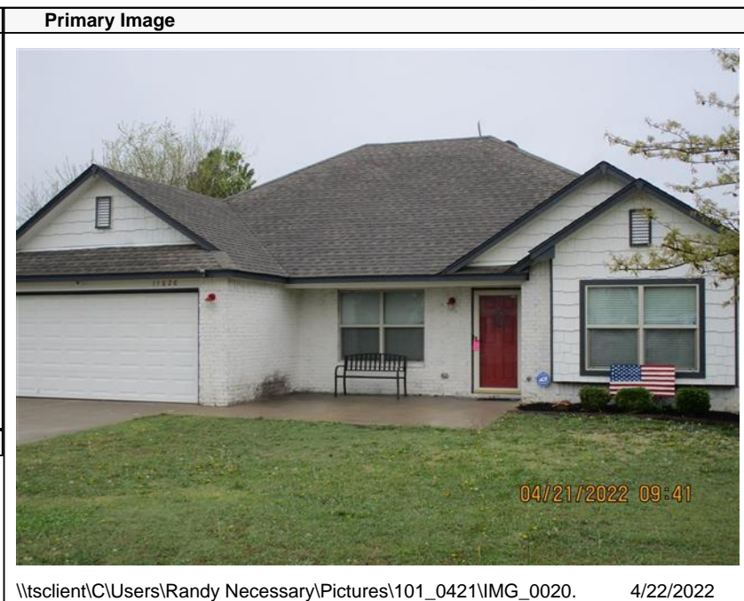
\\tsclient\C\Users\Randy Necessary\Pictures\101_0421\IMG_0020. 4/22/2022