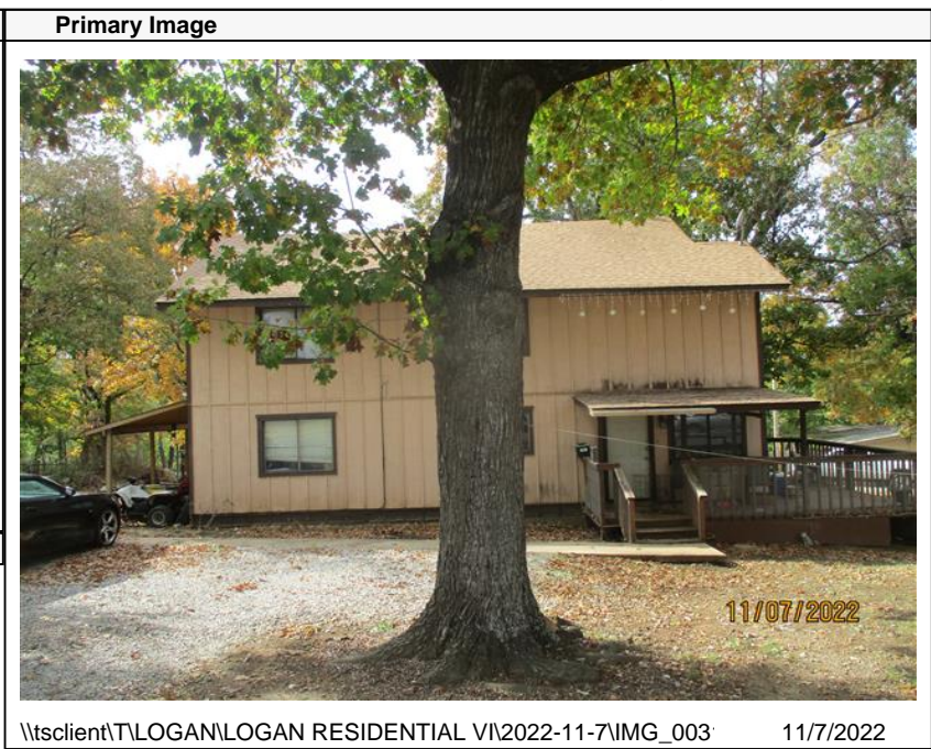
\\tsclient\T\LOGAN\LOGAN RESIDENTIAL VI\2022-11-7\IMG_003 11/7/2022