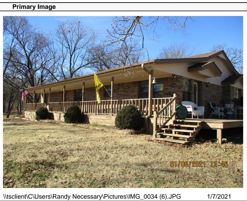
\\tsclient\C\Users\Randy Necessary\Pictures\IMG_0034 (6).JPG 1/7/2021