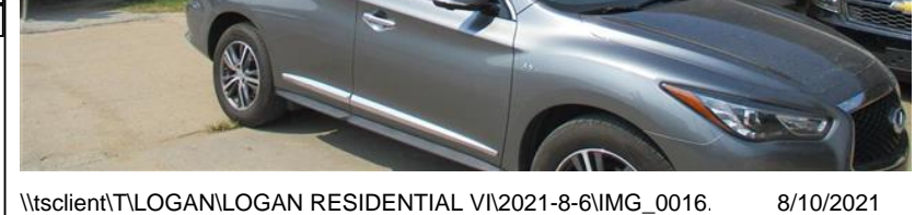
\\tsclient\TLOGAN\LOGAN RESIDENTIAL VI\2021-8-6\IMG_0016. 8/10/2021