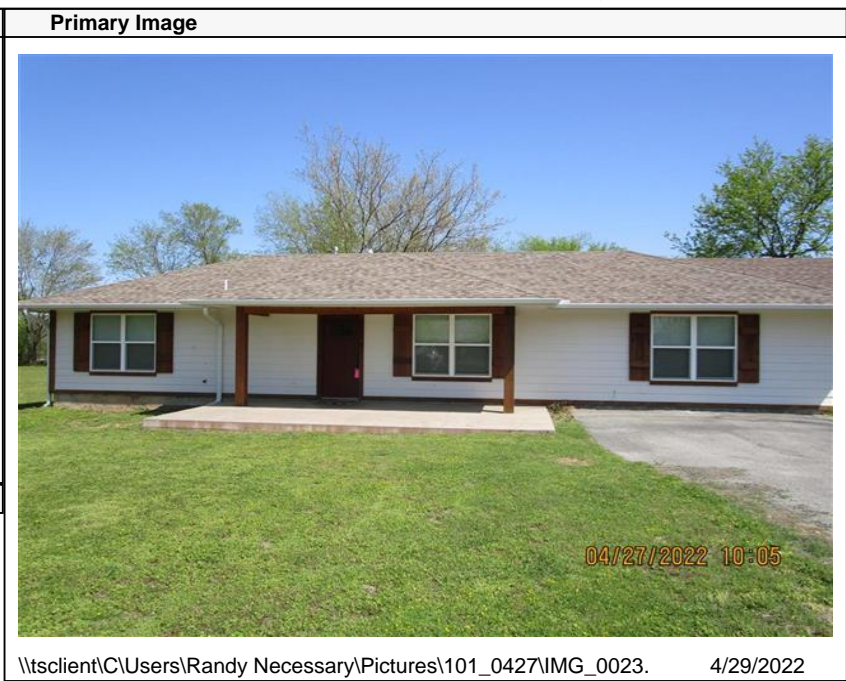
\\tsclient\C\Users\Randy Necessary\Pictures\101_0427\IMG_0023. 4/29/2022