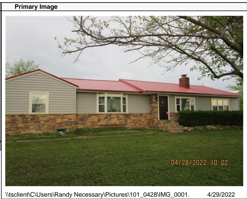
\\tsclient\C\Users\Randy Necessary\Pictures\101_0428\IMG_0001. 4/29/2022