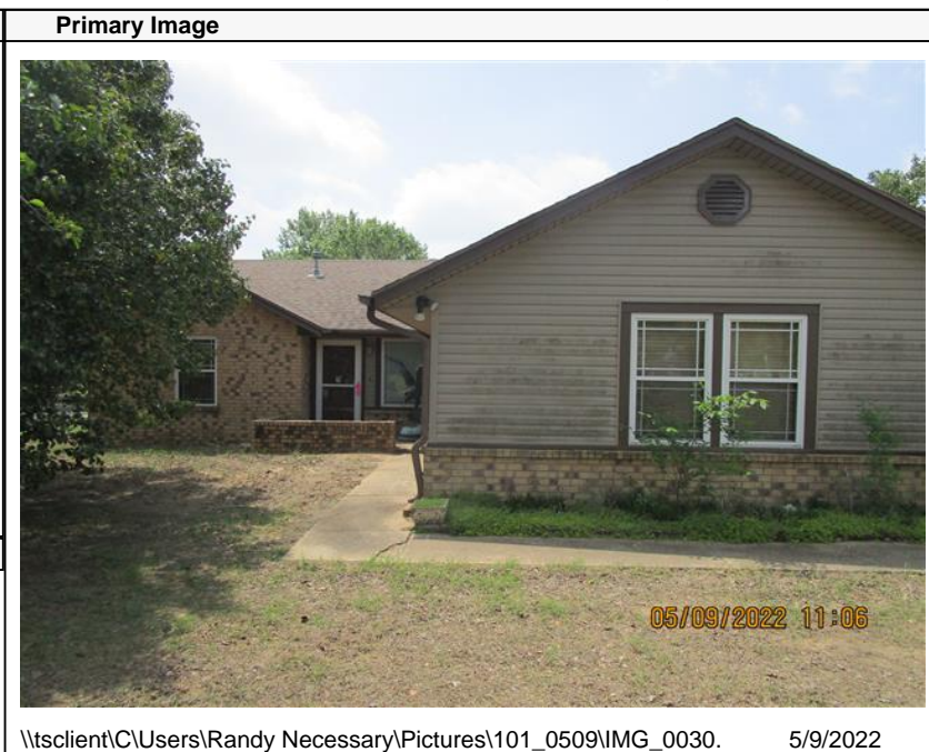
\\tsclient\C\Users\Randy Necessary\Pictures\101_0509\IMG_0030. 5/9/2022