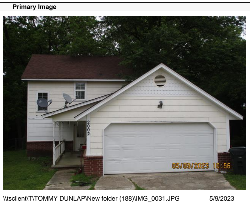
\\tsclient\T\TOMMY DUNLAP\New folder (188)\IMG_0031.JPG 5/9/2023