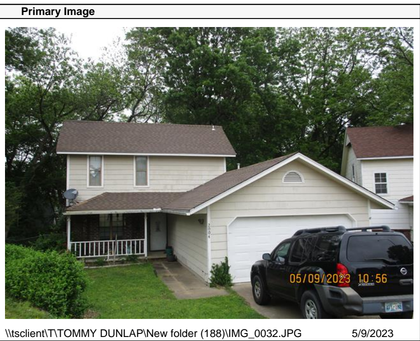
\\tsclient\T\TOMMY DUNLAP\New folder (188)\IMG_0032.JPG 5/9/2023