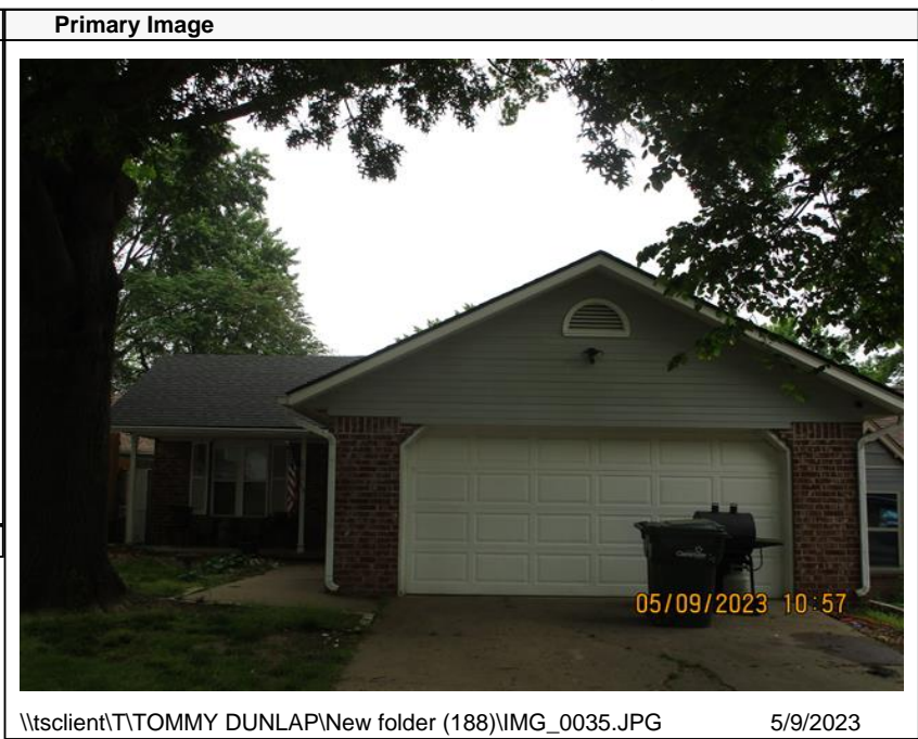
\\tsclient\T\TOMMY DUNLAP\New folder (188)\IMG_0035.JPG 5/9/2023