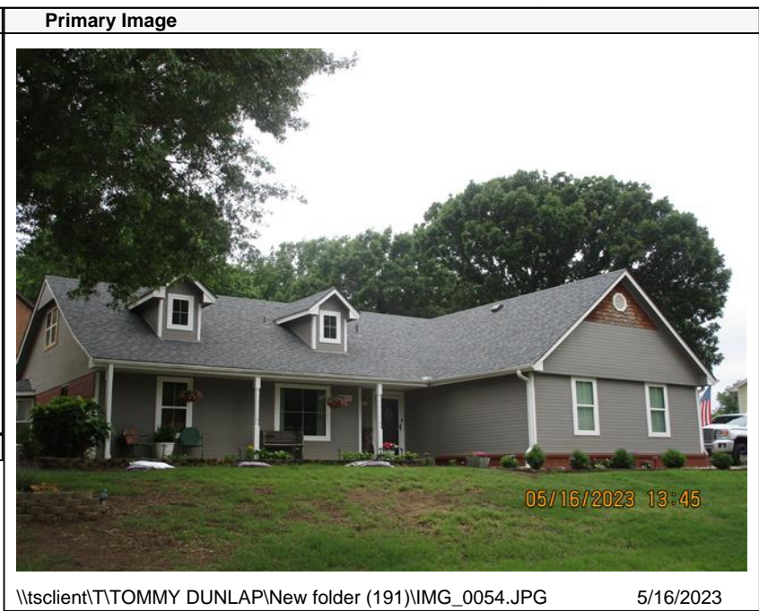
\\tsclient\T\TOMMY DUNLAP\New folder (191)\IMG_0054.JPG 5/16/2023