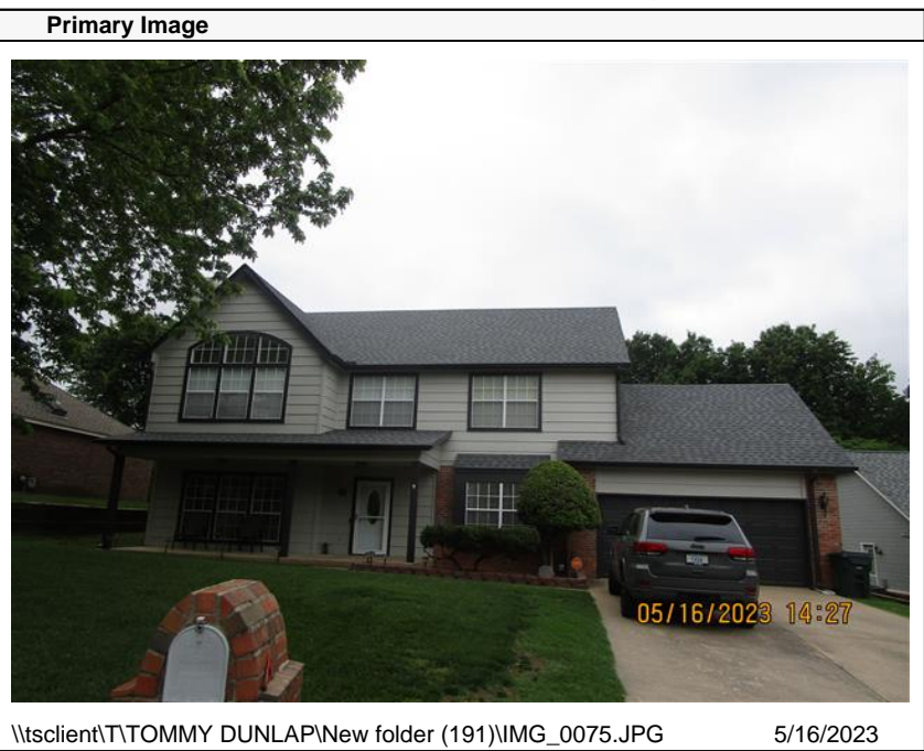
\\tsclient\T\TOMMY DUNLAP\New folder (191)\IMG_0075.JPG 5/16/2023