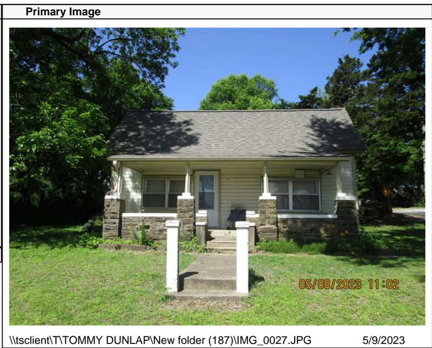
\\tsclient\T\TOMMY DUNLAP\New folder (187)\IMG_0027.JPG 5/9/2023