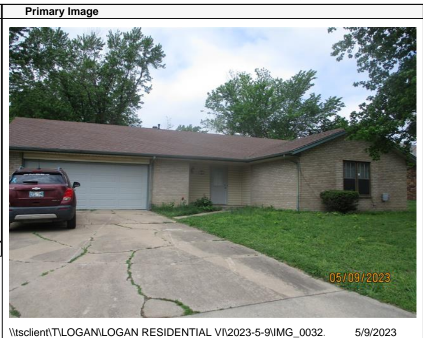
\\tsclient\T\LOGAN\LOGAN RESIDENTIAL VI\2023-5-9\IMG_0032. 5/9/2023