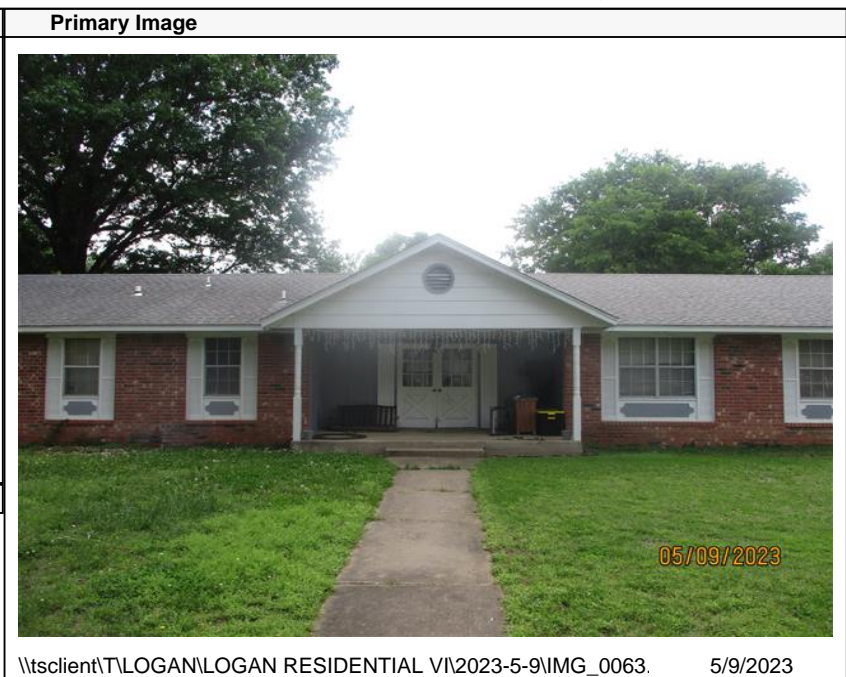
\\tsclient\T\LOGAN\LOGAN RESIDENTIAL VI\2023-5-9\IMG_0063. 5/9/2023