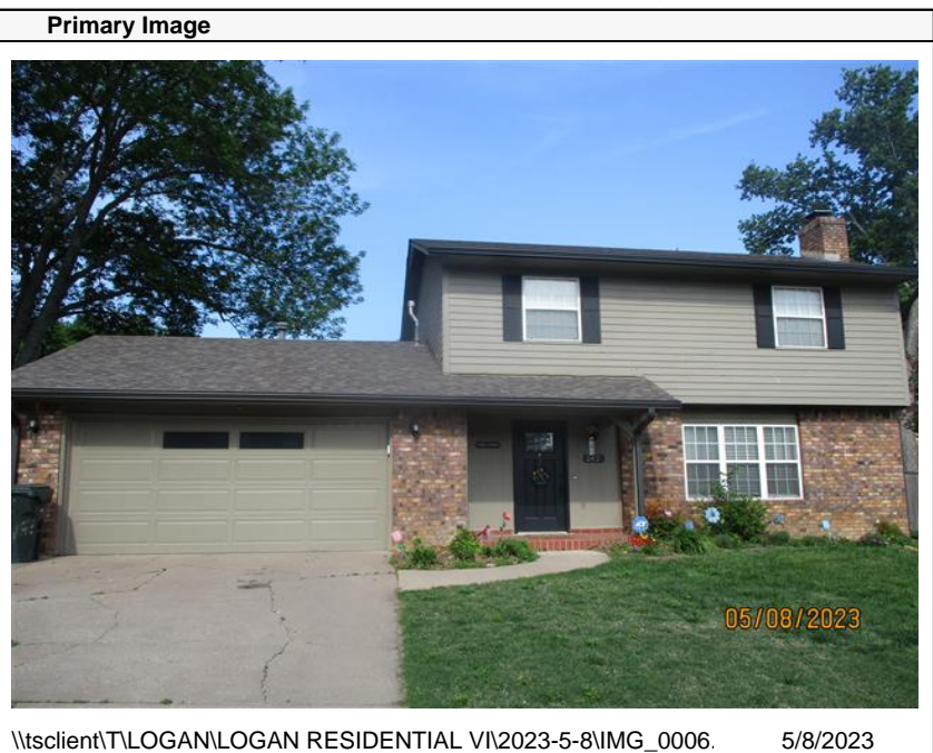
\\tsclient\T\LOGAN\LOGAN RESIDENTIAL VI\2023-5-8\IMG_0006. 5/8/2023