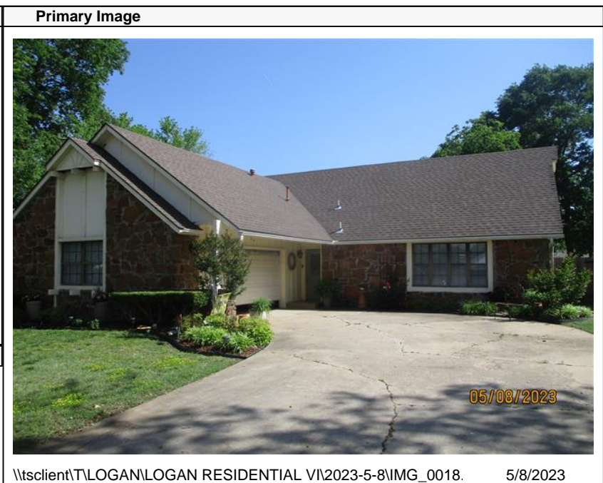
\\tsclient\T\LOGAN\LOGAN RESIDENTIAL VI\2023-5-8\IMG_0018. 5/8/2023