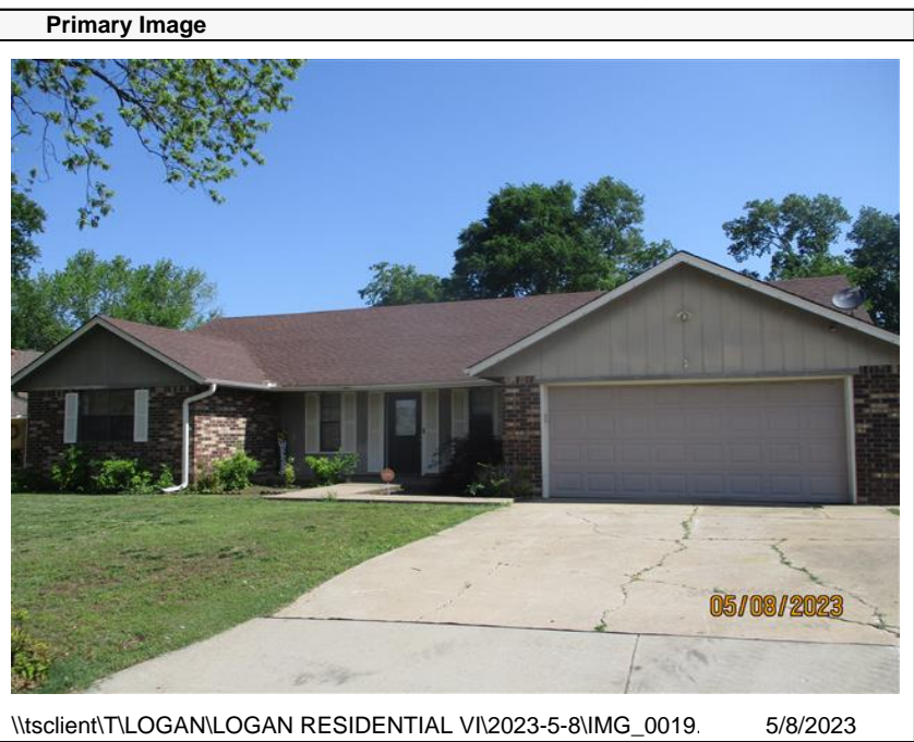
\\tsclient\T\LOGAN\LOGAN RESIDENTIAL VI\2023-5-8\IMG_0019. 5/8/2023