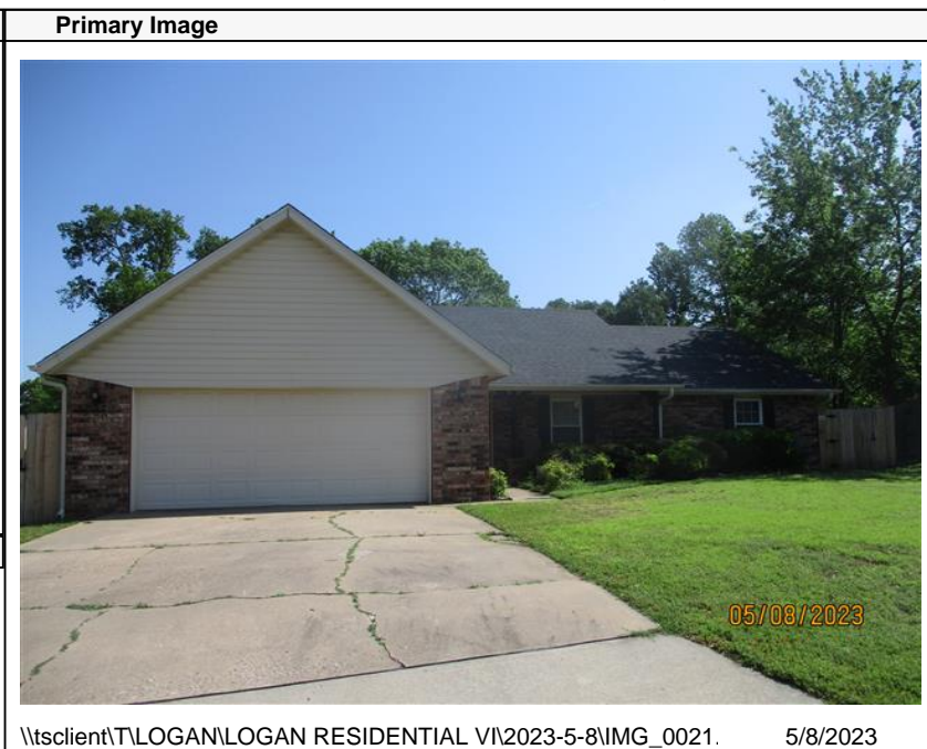
\\tsclient\T\LOGAN\LOGAN RESIDENTIAL VI\2023-5-8\IMG_0021. 5/8/2023