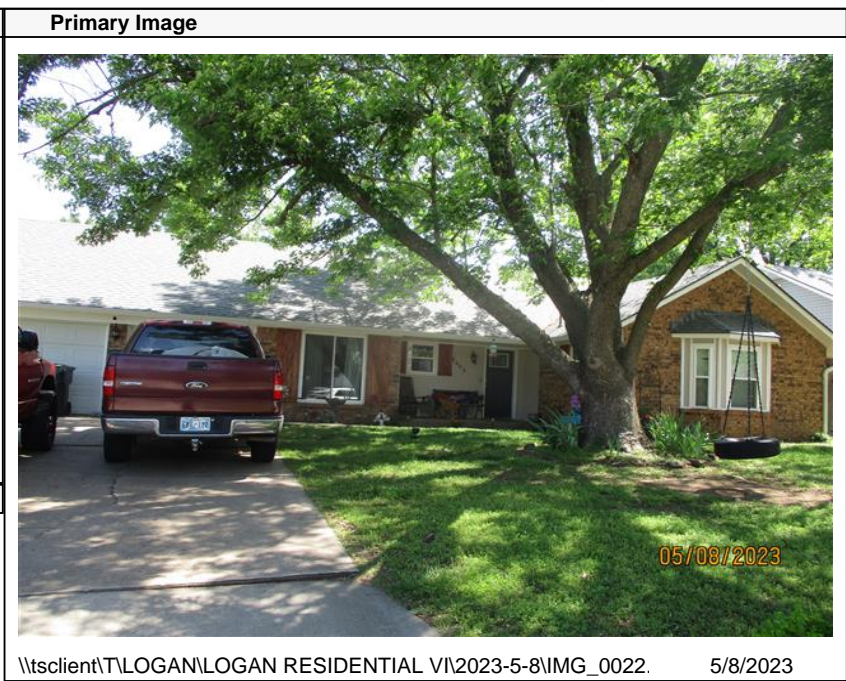
\\tsclient\T\LOGAN\LOGAN RESIDENTIAL VI\2023-5-8\IMG_0022. 5/8/2023