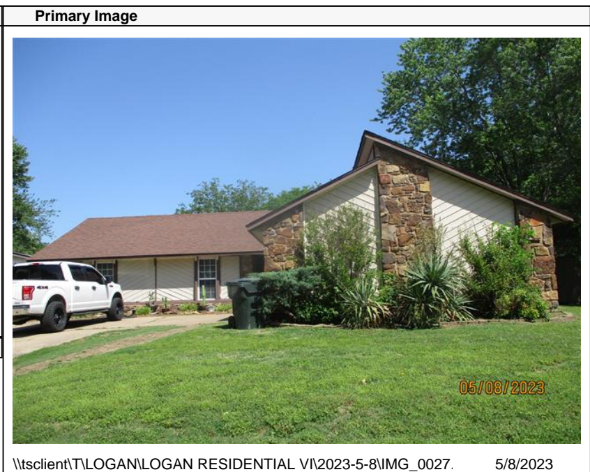
\\tsclient\T\LOGAN\LOGAN RESIDENTIAL VI\2023-5-8\IMG_0027. 5/8/2023