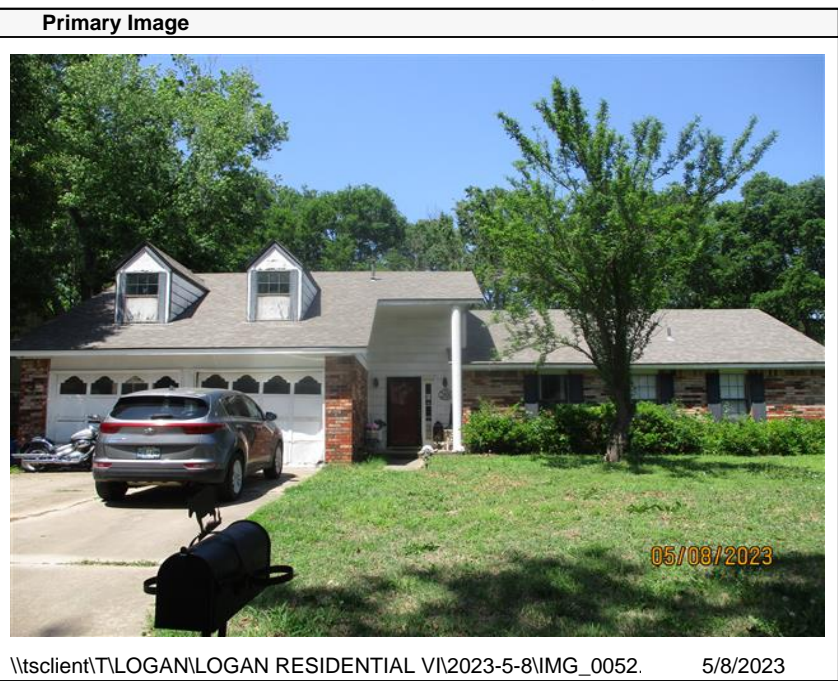
\\tsclient\T\LOGAN\LOGAN RESIDENTIAL VI\2023-5-8\IMG_0052. 5/8/2023