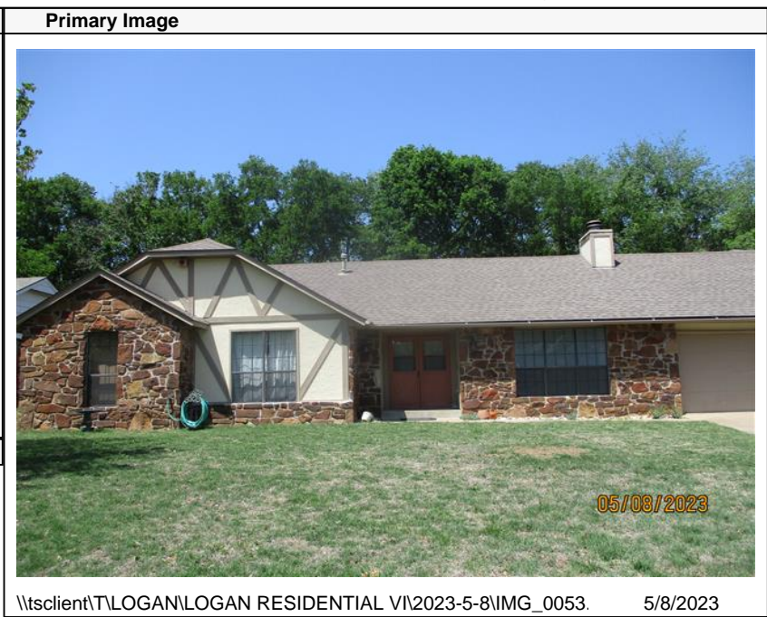
\\tsclient\T\LOGAN\LOGAN RESIDENTIAL VI\2023-5-8\IMG_0053. 5/8/2023