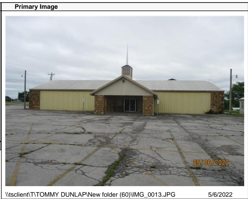
\\tsclient\T\TOMMY DUNLAP\New folder (60)\IMG_0013.JPG 5/6/2022