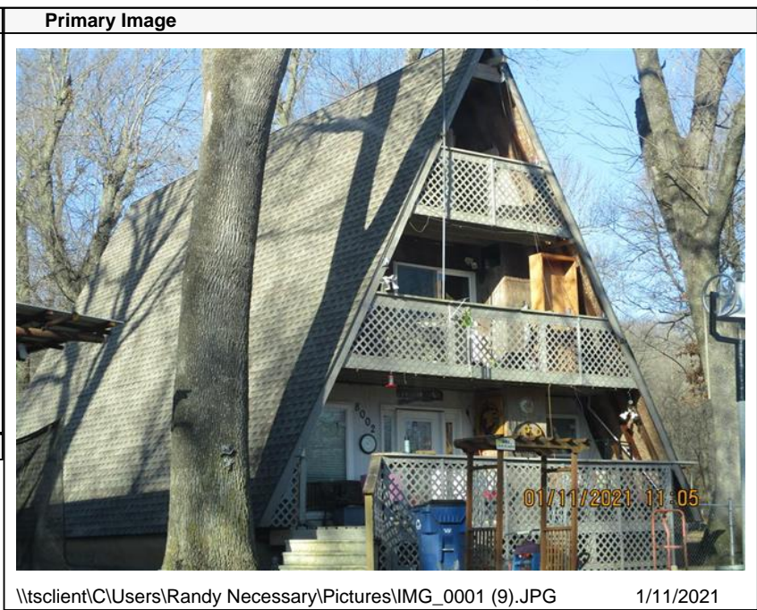
\\tsclient\C\Users\Randy Necessary\Pictures\IMG_0001 (9).JPG 1/11/2021