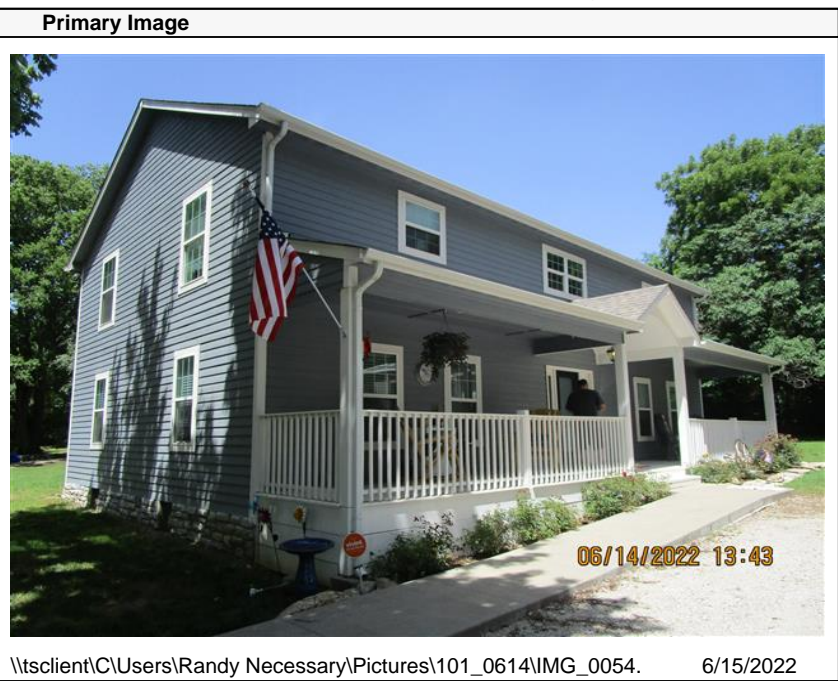
\\tsclient\C\Users\Randy Necessary\Pictures\101_0614\IMG_0054. 6/15/2022