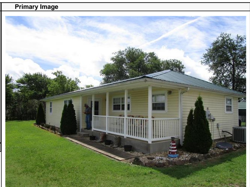
\\tsclient\C\Users\Randy Necessary\Pictures\101_0629\IMG_0002. 7/7/2021