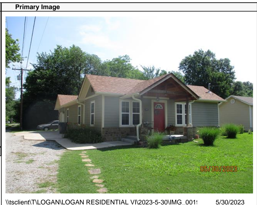
\\tsclient\T\LOGAN\LOGAN RESIDENTIAL VI\2023-5-30\IMG_001! 5/30/2023