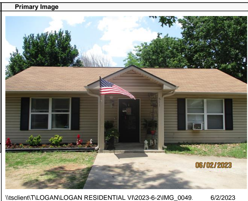
\\tsclient\T\LOGAN\LOGAN RESIDENTIAL VI\2023-6-2\IMG_0049. 6/2/2023