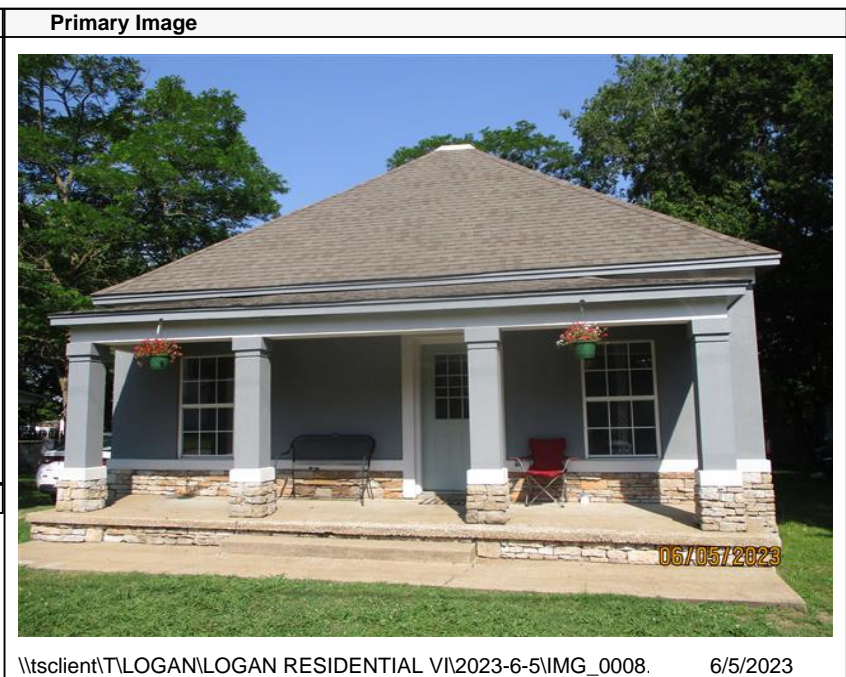
\\tsclient\T\LOGAN\LOGAN RESIDENTIAL VI\2023-6-5\IMG_0008. 6/5/2023