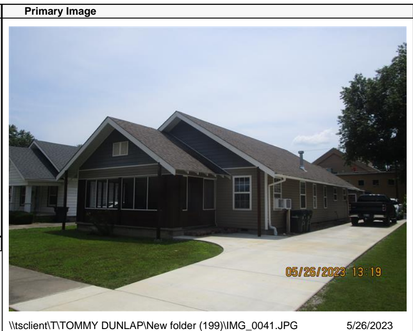
\\tsclient\T\TOMMY DUNLAP\New folder (199)\IMG_0041.JPG 5/26/2023