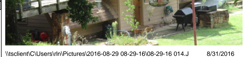
\\tsclient\C\Users\rln\Pictures\2016-08-29 08-29-16\08-29-16 014.J 8/31/2016