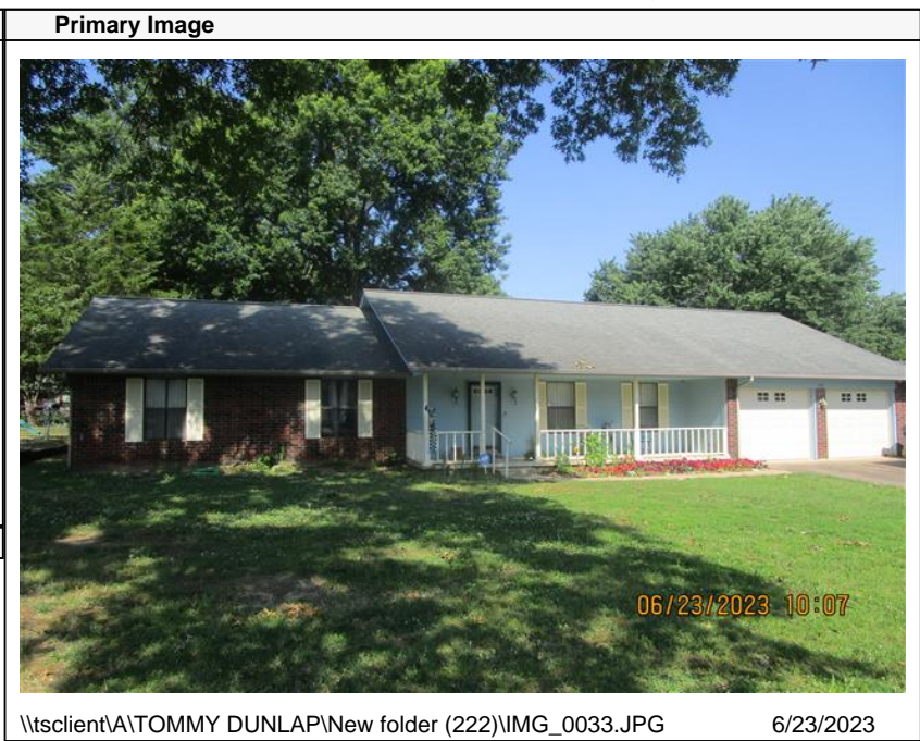
\\tsclient\A\TOMMY DUNLAP\New folder (222)\IMG_0033.JPG 6/23/2023