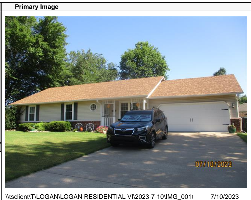
\\tsclient\T\LOGAN\LOGAN RESIDENTIAL VI\2023-7-10\IMG_001 7/10/2023