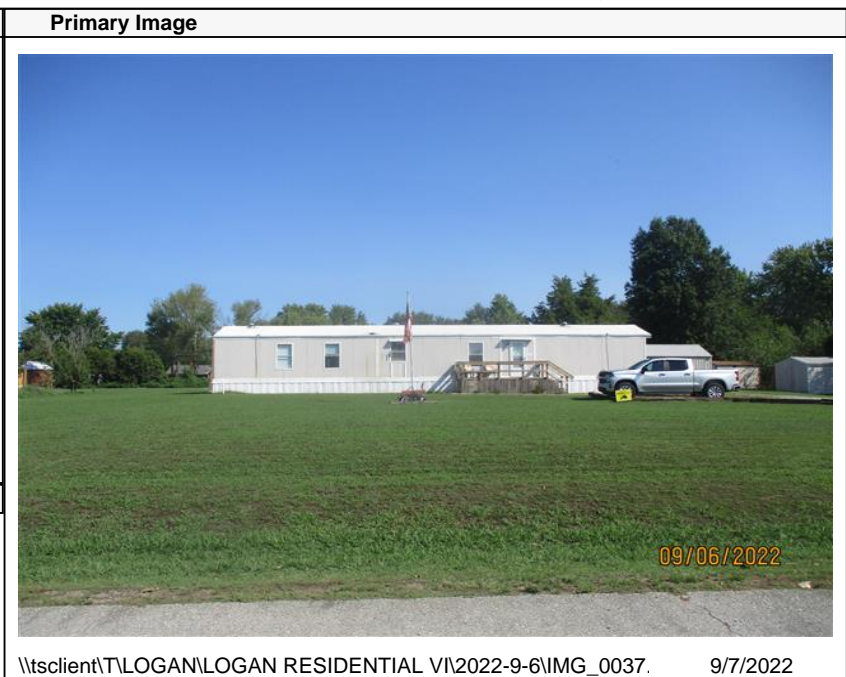
\\tsclient\T\LOGAN\LOGAN RESIDENTIAL VI\2022-9-6\IMG_0037. 9/7/2022