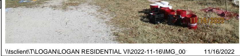
\\tsclient\T\LOGAN\LOGAN RESIDENTIAL VI\2022-11-16\IMG_00 11/16/2022