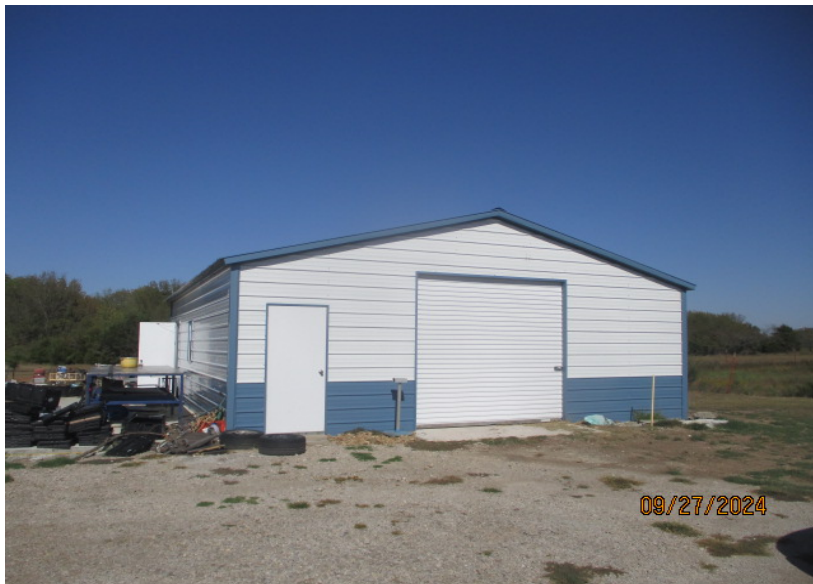
\\tsclient\T\TOMMY DUNLAP\New folder (390)\IMG_0001.JPG 9/27/2024

Lot Size Lot Count Units Buildable Non-Ag Acres 0 Topography Street Access Utilities Amenities LAND QUALITY Method Units-Buildable Base Lot Value Factor Value Adjustments Lot Value