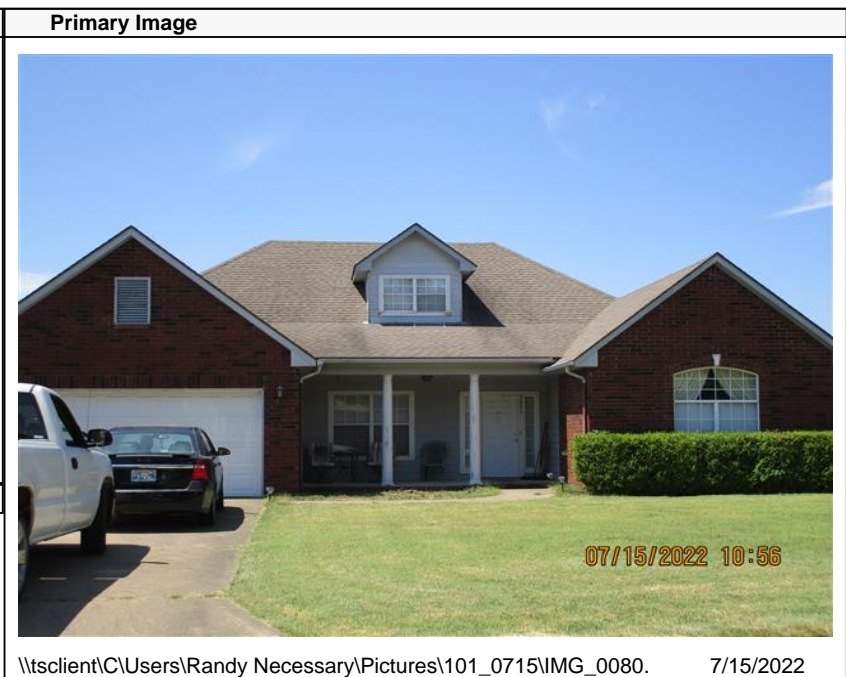
\\tsclient\C\Users\Randy Necessary\Pictures\101_0715\IMG_0080. 7/15/2022