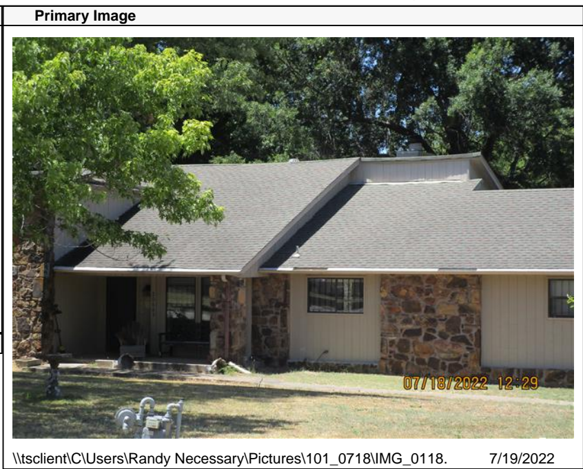
\\tsclient\C\Users\Randy Necessary\Pictures\101_0718\IMG_0118. 7/19/2022