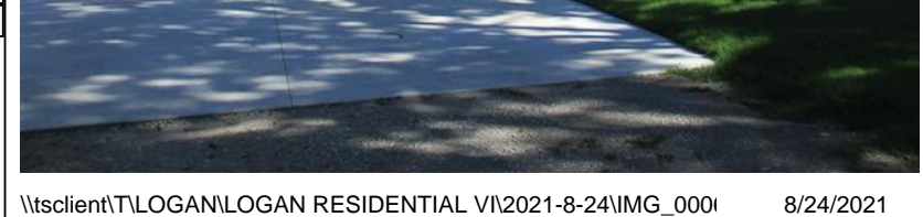
\\tsclient\T\LOGAN\LOGAN RESIDENTIAL VI\2021-8-24\IMG_0001 8/24/2021