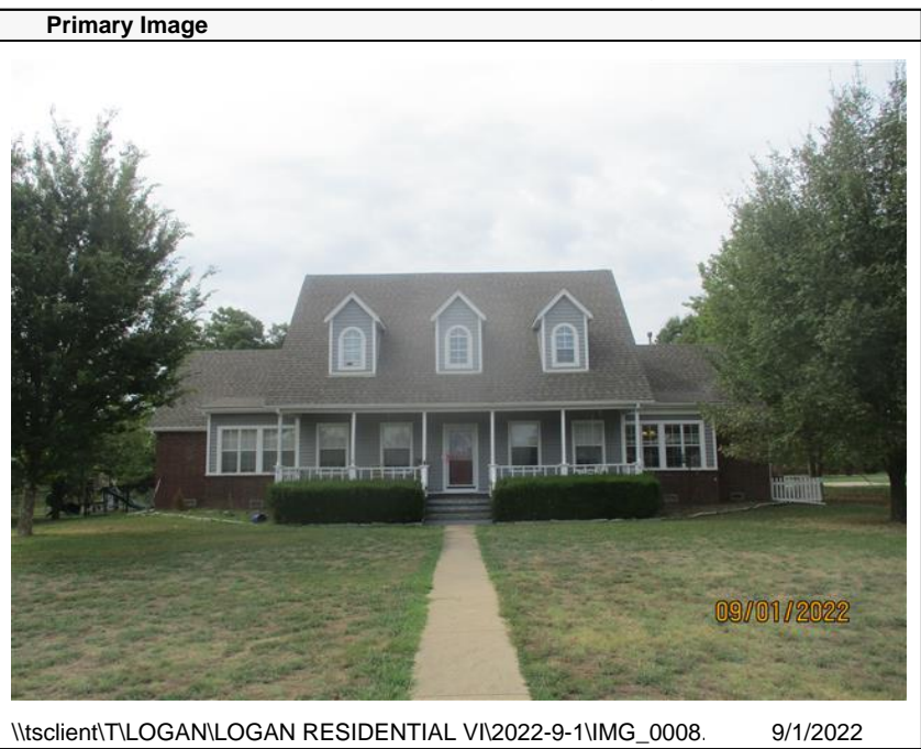
\\tsclient\T\LOGAN\LOGAN RESIDENTIAL VI\2022-9-1\IMG_0008. 9/1/2022